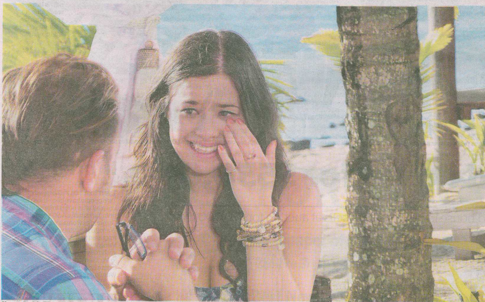
Singer Jackie Thomas hopes she can repay her supporters' faith which is to thank for her return to The X Factor .